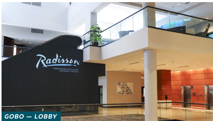
GOBO — LOBBY