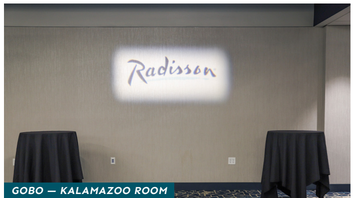
GOBO — KALAMAZOO ROOM