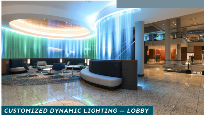
CUSTOMIZED DYNAMIC LIGHTING — LOBBY