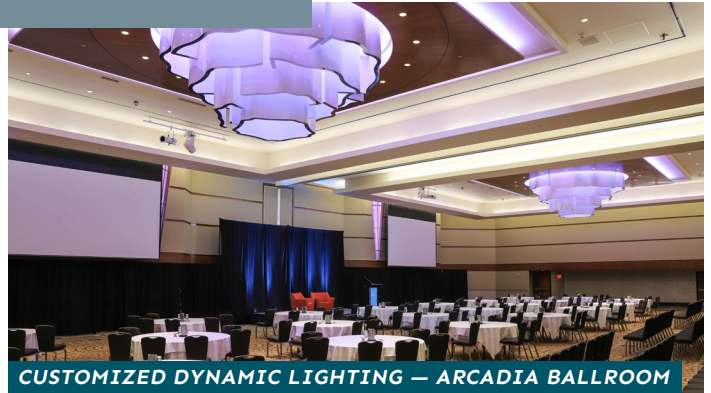
CUSTOMIZED DYNAMIC LIGHTING — ARCADIA BALLROOM